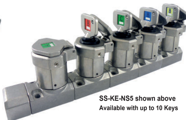
SS-KE-NS5 shown above Available with up to 10 Keys